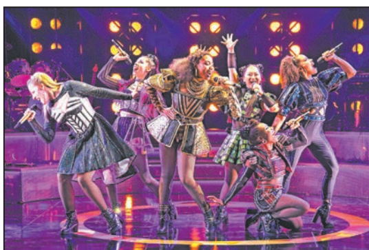
Six the Musical

Minnesota Orchestra at Orchestra Hall presents Handel’s “Messiah” on 12/6 and 12/7 at 8 p.m., with tickets $12 to $135. The Target Center hosts Amy Grant, Michael W. Smith, with