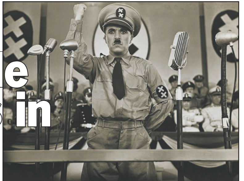
Charlie Chaplin as the The Great Dictator. His political party was a symbol for the double-cross, a satire on Hitler's swastika.

Of course, the big losers in all of this are the Kurds, but they're communists, so it's a win-win for everybody else. But that is to fatally underestimate the Kurdistan Worker's Party's ability to survive. Immediately, recognizing reality, the Kurds made a deal for survival with Syria. For them it's a setback, but it's probably not fatal. They'll withdraw and they'll eventually re-