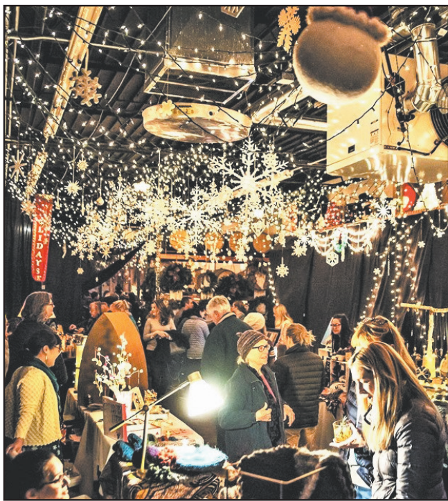
Hygge Holiday Market at Lawless Distilling