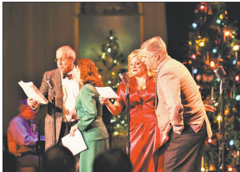
"It's a Wonderful Life" in St. Paul

7:30 p.m., tickets start at $25. At the Saint Paul Hotel (only for the well-heeled) there is a presentation of "It's a Wonderful Life" as a live