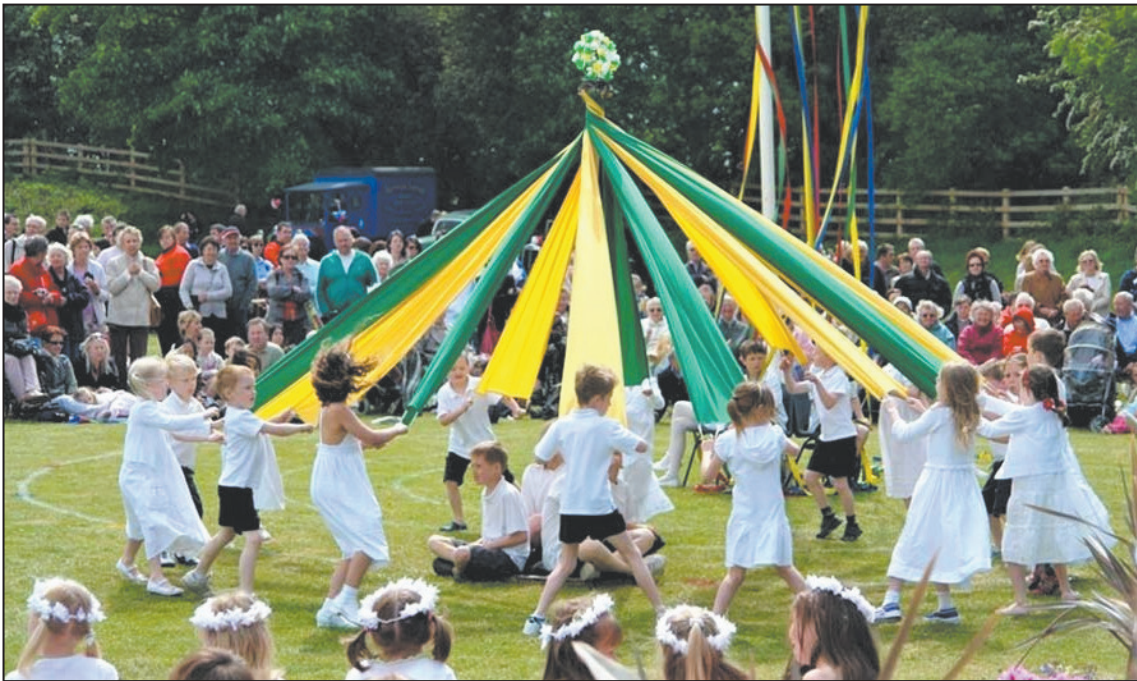
Maypole dance at Heart of the Beast Mayday celebration

Park for everyone to express themselves.