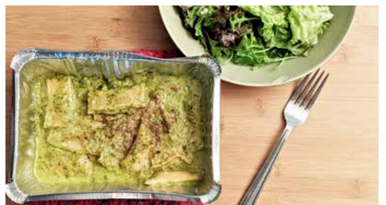
ie Italian Eatery’s take-out agnolotti with the writer’s own salad

Los Andes Latin Bistro is finally open. We have chefs from South America ready to make your mouth water! Try our famous Empanadas and our tasty Bandeja Paisa.