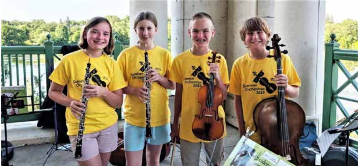
Greater Twin Cities Youth Symphonies offer week-long summer camps for beginning to advanced students.

Youth Symphonies will offer three week-long summer camps for beginning to advanced strings, woodwinds, brass and percussion. Half-day sessions led by GTCYS conductors will take place in downtown St. Paul, capped by a final performance at the Landmark Center. https://gtcys.org/programs/summer The Children's Theatre Company has a wide variety of week-long day camps June through August, each with a different theme and grade level for participants. See childrenstheatre.org/education-and-engagement/for-children-and-families/camps . Circus Juventas offers three types of summer camp op-