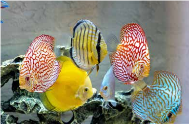
Colorful discus fish in a freshwater aquarium

First decide between three types of aquarium environments to go for – freshwater, brackish water or salt water. All other choices for your aquarium start from there.