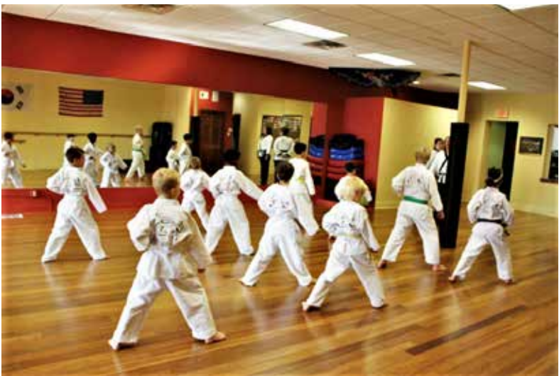
Summer Day Camp at Classic TaeKwonDo Studios