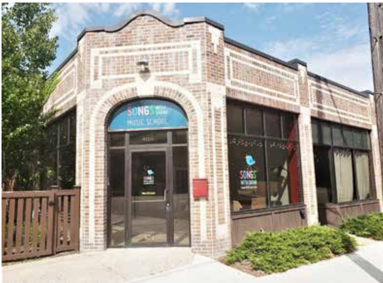
Songs with Sarah Music School at 4th Avenue and East 48th Street

tions: performance week-long camps, daily sampler camps, and teen high-flying adventure camps. Camps are for ages 6 through 18, where students are assigned groups based on age. See circusjuventas.org/summer-camps . Art camps for making things – arts and crafts, pottery, fire arts It's impossible to sum up briefly what Summer Adven-