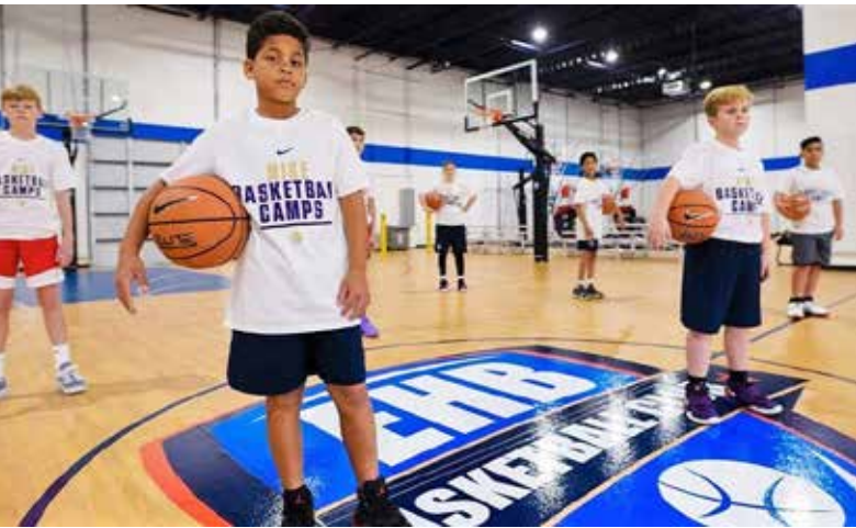
Nike Basketball Camp at North Central University

out www.ywcamps.org and navigate to the summer camps page. Camp Tanadoona in Excelsior is operated by Camp Fire, one of the oldest camping organizations around. Tanadoona hosts both day camps and a two-week residential camp, and offers an array of choices including outdoor activities, sports, arts and crafts, and more. They also have scholarships. See campfiremn.org/camps/tanadoona . Finally, if it's a residential camp you want, there is another trusted name in Minnesota. Camp Pillsbury, located in Owatonna, is a co-ed camp for ages 5 to 17. Although they do operate a day camp for kids within driving distance, it's mostly known as a residential camp, with dorms, a movie theater, horseback riding and a lake. Check out camp-pillsbury.com .