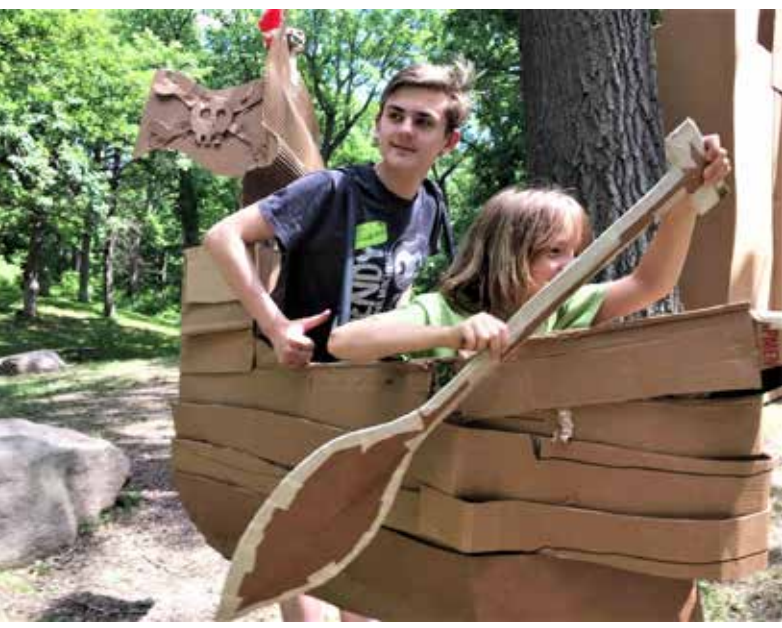
Summer Adventure Camps from Adventures in Cardboard

week-long program open to all K-8 youth. Each fun-filled day will include things like swimming, hiking, climbing, archery, STEM activities, outdoor skills, crafts and more. They offer multiple sessions at a variety of metro locations. Go to https://camp.northernstar.org/Article-Detail/discovery-day-camp for full information. Great River School's summer camps provide kids aged 4-17 a fun way to spend a week exploring, building, learning, moving, creating and having a blast. Choose from sessions focusing on art, nature, robotics, cooking, ultimate frisbee, bookmaking and more. Great River School strives to make summer camp possible for all kids, with early-bird pricing, sibling and multi-program discounts, and scholarships available to all. See www.greatriverschool.org/summercamp for all the details. YWCA Minneapolis is offering summer camps all summer for kids in grades K through 5 this school year. Curriculum is all-inclusive of STEM, arts, outdoor play, indoor quiet time, and even includes both breakfast and lunch. Check