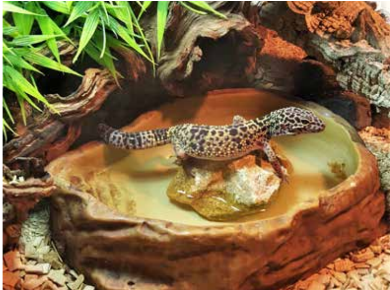
A leopard gecko in its tank, complete with pool

Don't take this to mean that keeping fish in an aquarium is easy or without possible complications. So as not to inherit someone's hidden problems, I recommend that the beginner start from scratch. Proper steps are required to do it right, and patience is important.