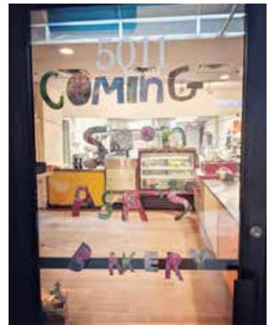
See The Dish , page 12 Asa’s Bakery’s new place

“In treating people with disordered eating, that’s how I became so acutely aware of the harms of diet culture. When you see them make a lot of progress in their recovery and that progress is just undone by a doctor making some comment or seeing an ad on-