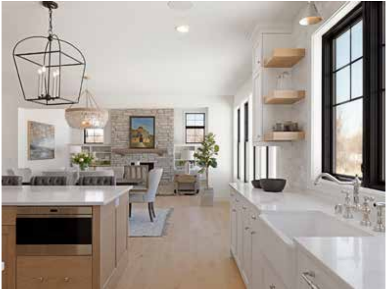
Traditional style in a newly built home from the Parade of Homes

One popular event is the Lake Home and Cabin Show, which happens only in Wisconsin and Minnesota. Minneapolis's version takes place on Feb. 10 - 12 at the Minneapolis Convention Center. In addition to homes, from tiny one-room cabins to vast compounds, this show covers camping and boating with such items as teardrop camper-trailers and boats and boat docks. You can also get information