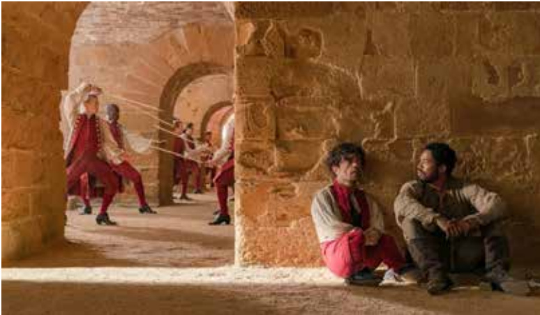
A scene from 'Cyrano,' with Peter Dinklage as Cyrano and Kelvin Harrison, Jr., as Christian

about Minnesota is the way our entrepreneurs and educators and artists lean into the eclectic interests of the Minnesota public. Here are some events that I'm pretty sure would not catch on in most states. (Tickets for all three of these are available on eventbrite.com.)