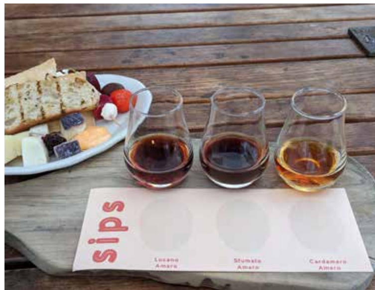
Amari tasting at un dito

Un dito, the little casual brother of i.e. Italian Eatery (4724 Cedar Ave.), had an amari tasting event in mid-January on a really yucky day. Because I had bought a ticket, I pried myself off my desk chair, put on shoes, then drove there and tasted some amari. Amari is the plural of ama-